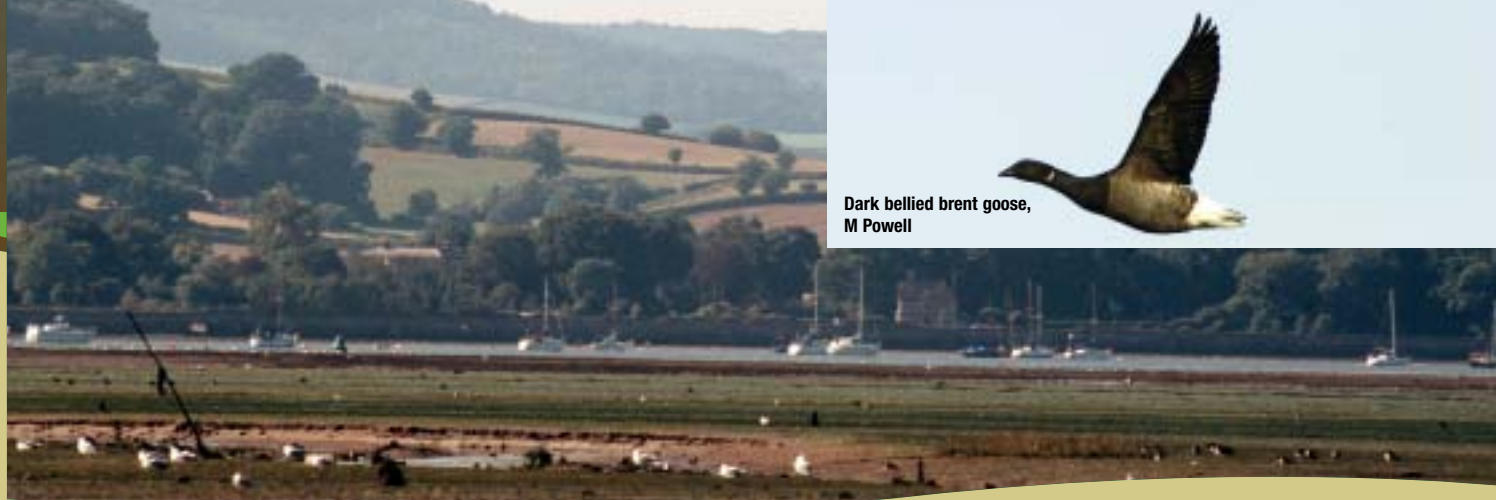
Dark bellied brent goose, M Powell

Part of the nature reserve is a mussel bed, known as Little Bull Hill, on which can be seen a remarkable bird behaviour. Gulls and crows have learnt to drop mussel shells from height to break them and get to the soft animal inside. They fly up about 10 metres with the mussel in their beaks, before dropping it onto the rocks and quickly stooping down to feed on the insides.