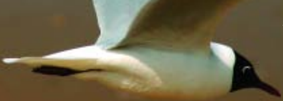
Black headed gull, T Hyde