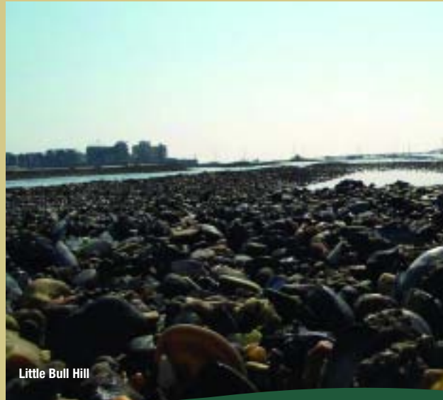
Little Bull Hill

Walking out over the sandbanks at low water offers you the chance to get away from the town and explore a wilderness in the middle of the estuary.