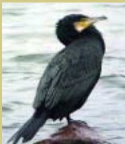
Cormorant, D Atkinson

Also during the winter months, other wildfowl crowd into the estuary to make the most of its glut of food. Look out for huge flocks of wigeon in flight over the water, and graceful pintail ducks feeding on submerged plants.