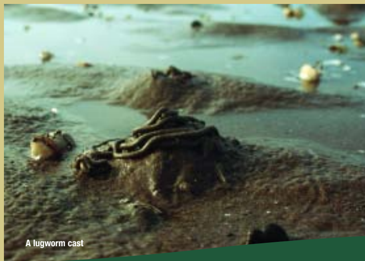
A lugworm cast

The weasel run, part of the East Devon Way, runs alongside the nature reserve. It is accessible to wheelchairs and offers great views across the nature reserve. Out on the sand there are no formal access routes, so you are free to explore this wild area. Please be careful when walking out on the mud, as it can be very deep in some places, if you are at all unsure about whether it is safe, turn back immediately and retrace your steps – wellington boots are an absolute must for Exmouth Local Nature Reserve! Crossing creeks between sandbanks can be dangerous as the incoming tide can quickly isolate large areas. Always be aware of the tide for your own safety – will it be coming in or going out during your visit? Dogs are welcome on the nature reserve but please keep them under close control.