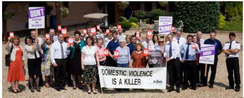
Devon Drug & Alcohol Workers Support the Red Card

During 2010, the Community Safety Partnership was able to raise public awareness of this under-reported but extremely significant and very often violent crime. We were able to promote support services available to victims and families that need advice.