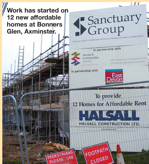
Work has started on 12 new affordable homes at Bonners Glen, Axminster.