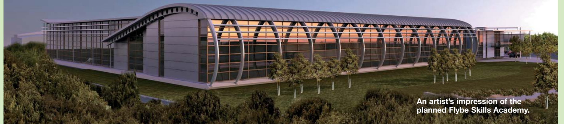
An artist's impression of the planned Flybe Skills Academy.

WORK on East Devon's long-awaited new community of Cranbrook could finally be about to start, thanks to a series of successful funding bids. What's more, it could become a "zero carbon" trail-blazer!