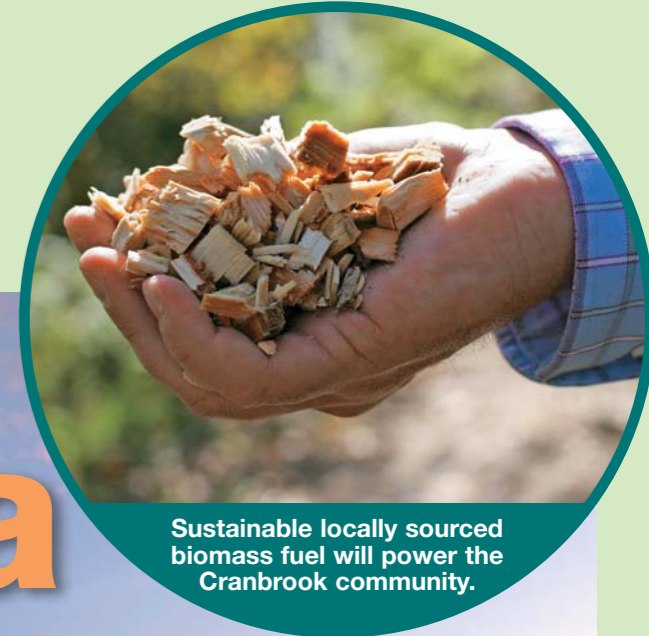
Sustainable locally sourced biomass fuel will power the Cranbrook community.