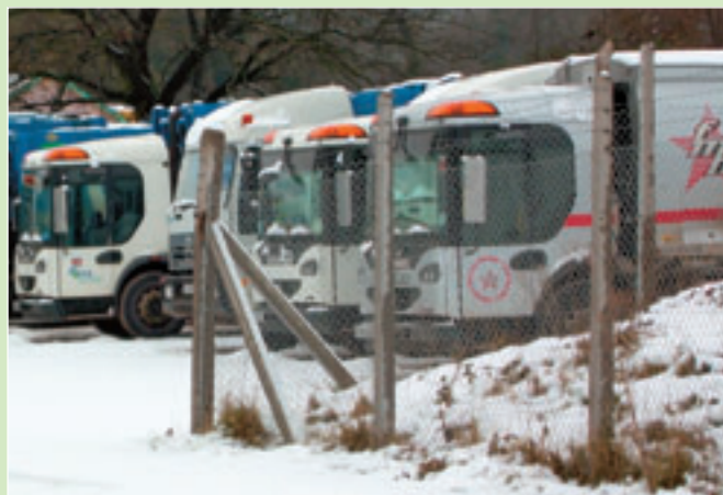
Like London's buses at the height of the blizzards, East Devon's fleet of refuse and recycling trucks were grounded on 6 February. Crews were out the following week catching up with missed collections.

WHEN blizzards swept across many parts of the UK in early February, East Devon took its fair share of the chaos wreaked by the storms.