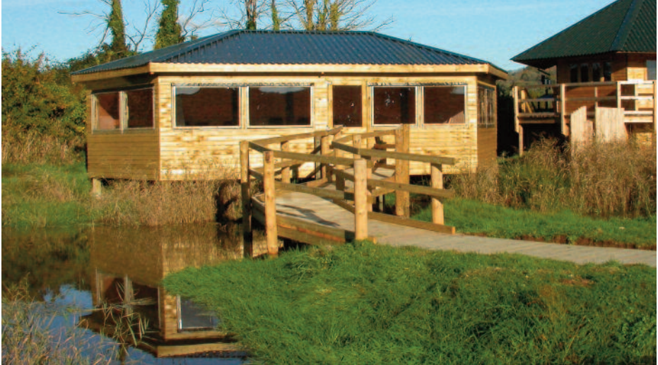
The new wetlands Classroom

Built on stilts over a reed bed, the Wetlands classroom offers a fabulous all weather facility for visiting educational groups. The classroom can easily accommodate a class of 30 students and is an ideal base from which to explore the Wetlands.