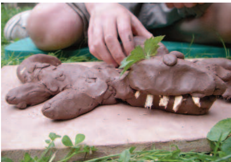
Artwork produced by children at the Axe EstuaryWetlands