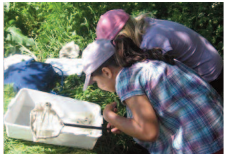
Discovering what lives in the underwater world of the Wetlands