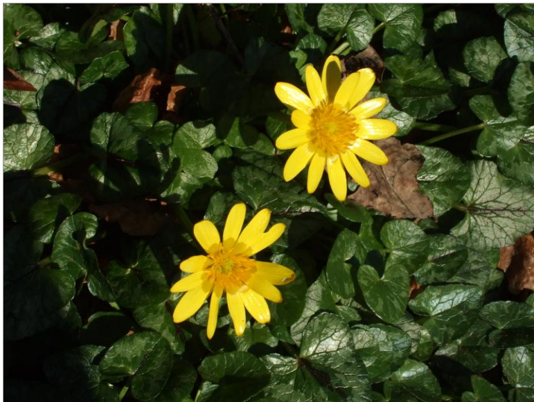
Celandines at Colyford