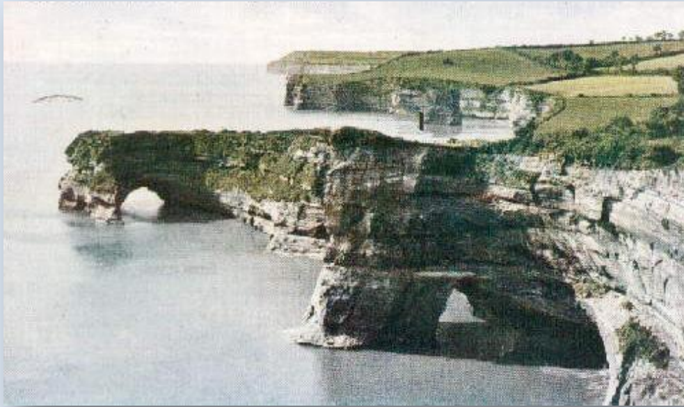
Two arches at Ladram Bay at the start of the 20th Century