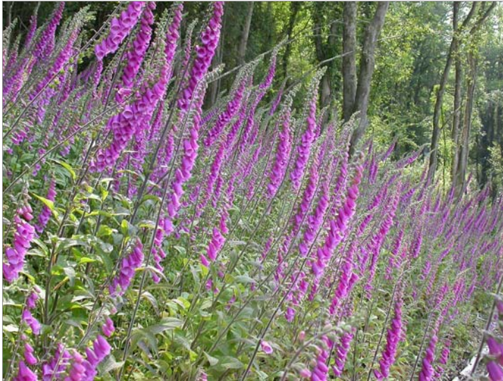
Foxgloves at Holyford Woods