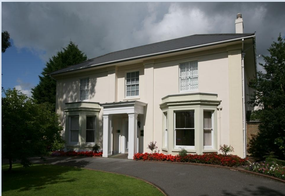
Elmfield House, Honiton – to be expanded and improved for 2010 - see page 2