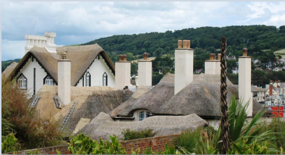
Sidmouth roof tops