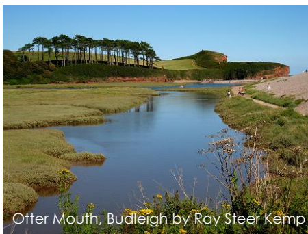
Otter Mouth, Budleigh by Ray Steer Kemp

In the presentation of Verdi's opera 'Rigoletto' with international soloists the festival organisers hope to dispel the myth that you can only see good opera performance in London or Cardiff.