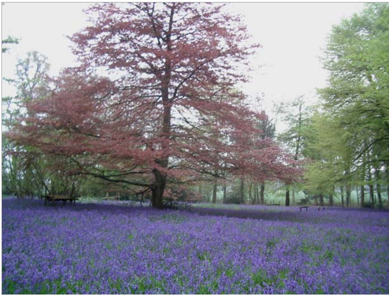
Rolling out the blue carpet