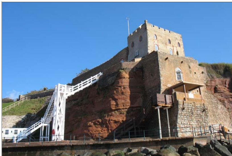
Jacobs Ladder, Sidmouth