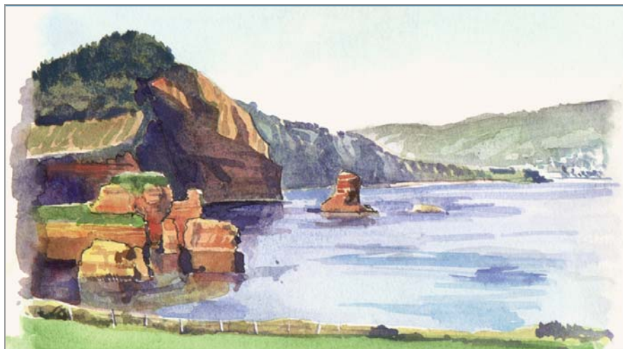
Ladram Bay Watercolour by Peter Lightfoot