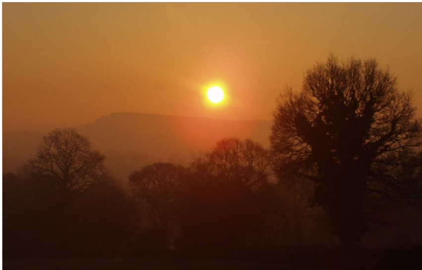
Otter Valley at Dawn