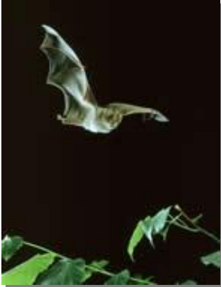
Magnificent Greater Horseshoebat in Flight

The East Devon Area of Outstanding Natural Beauty (AONB) has been awarded £61,000 grant money from the SITA Trust for a three year initiative, 'Looking out for bats', to survey rare Greater Horseshoe bats and enhance roost areas in this special area.