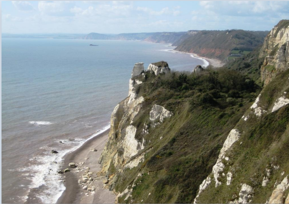
Branscombe Cliffs • Photo by Cherise Foster