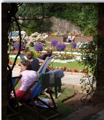
Photo: Connaught Gardens

The public are generally delighted with the standard of our flagship gardens in Sidmouth and Exmouth. The survey, taken of a sample of locals and visitors during Summer and early Autumn, shows that people are very happy with both gardens. Over 97% said that the floral displays, seats and benches and cleanliness were good. A total of 100 people using each of the gardens were asked to answer 20 set questions. The questionnaire was completed by officers in face to face interviews.