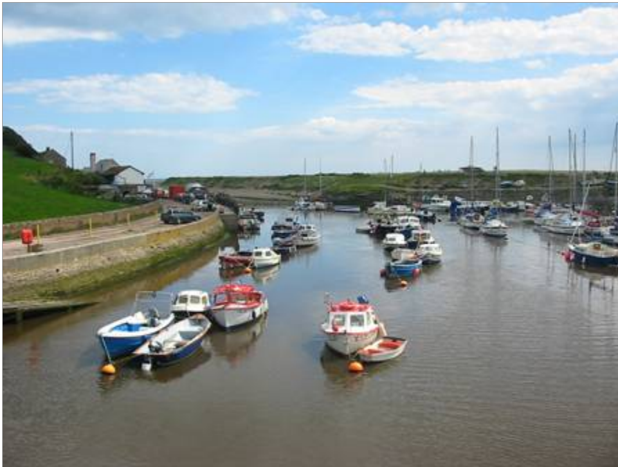
Harbour at Seaton