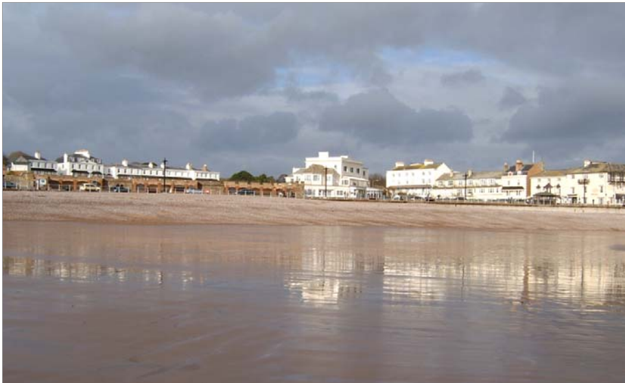
Low tide at Sidmouth