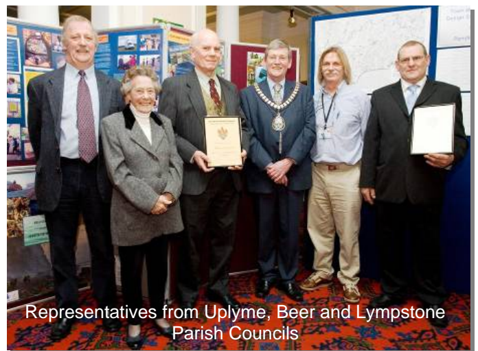
Representatives from Uplyme, Beer and Lymptone Parish Councils

"I am sure everyone will have taken away some great ideas, ways of doing things and contacts from this event and I look forward to seeing these being developed over the next few years. To this end, I asked the councils present to make a pledge which could be big, like progressing affordable housing, or something more quickly achievable, like taking to visit a local youth club or starting the parish plan process. I shall be writing to those who have made a pledge to see what they are doing and to offer EDDC's help to make it happen."