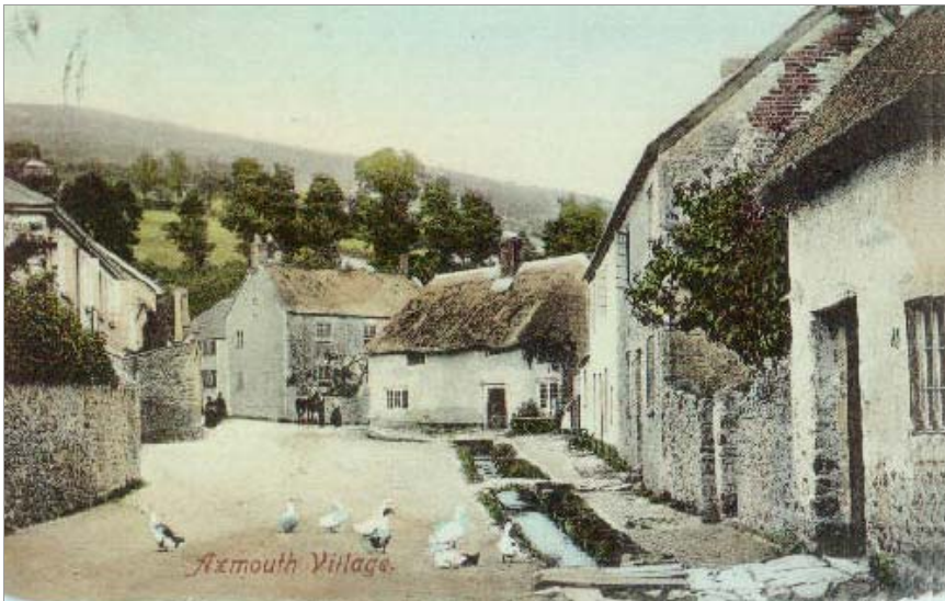
Axmouth around the start of the 20 th century