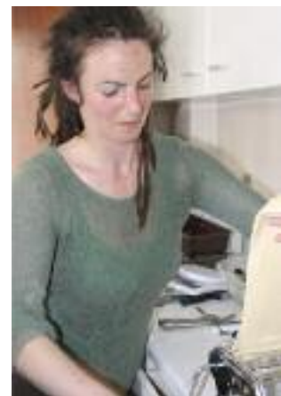
Clockwise from top: face painting at the All Hallows play day, at the 'Confidence in Cookery' class, and having fun making movies