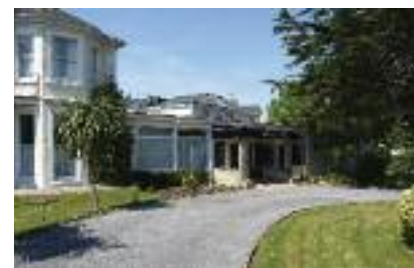
The Anchorage Hotel, Torquay

The Anchorage Hotel, Cary Park, Torquay (image below) is the preferred venue and has been used since 1992. The hotel welcomes up to twenty holiday residents annually and provides a 'full board' holiday. Six rooms are on the ground floor and the remainder have lift access. There is also evening entertainment at the hotel, apart from Wednesdays.