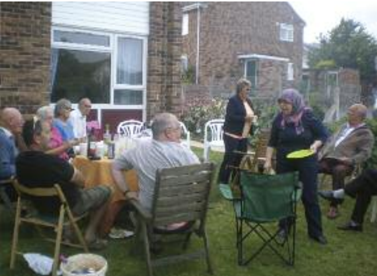
Above: the new shed, funded by the Community Initiative Grant Below: residents celebrating with a BBQ Right: the well-kept gardens at Powell Close

This project has brought people together as a community. Residents are proud of what they have achieved, and it has all been made worthwhile when people passing have been complimentary of the lovely garden. This area has also been enhanced by the hard work residents have put into their own individual gardens in Powell Close. If you wish to apply for a Community Initiative Grant please contact Tenant Participation (details on page 2).●