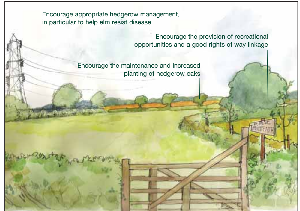
Management Guidelines Illustration