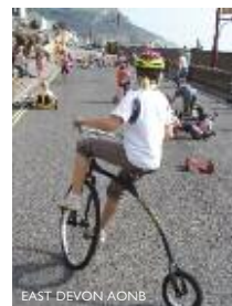
There's lots going on for visitors in and around Seaton, such as the Seaton Festival of Cycling and the popular Sidmouth Folk Festival