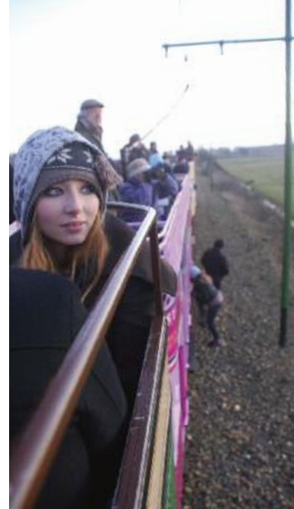
On the popular Seaton Tramway

The Axe Estuary Wetlands nature reserve is within a short walk of the proposed centre, and is one of the best sites for bird watching in Devon. The Wetlands has a busy programme of events, which are set to expand and complement the wide event and festival attractors in the area, and means that the wetlands bring economic, environmental, and social benefits to the area.