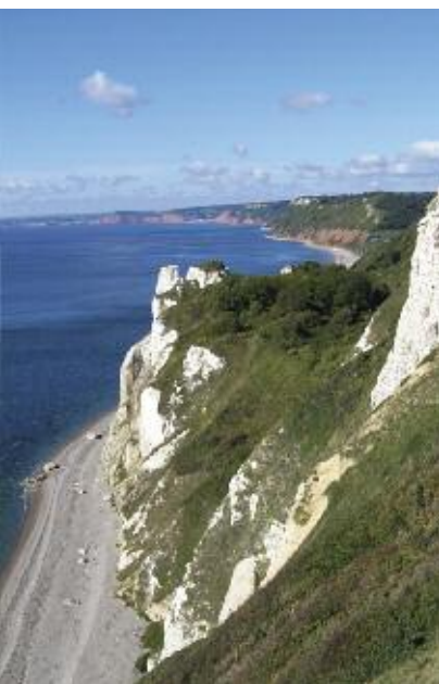
EAST DEVON AONB

Plans for the proposed Discovery Centre have been approved in principle subject to certain conditions being met. Plans and planning documents have been provided with the Tender Pack information on the website.