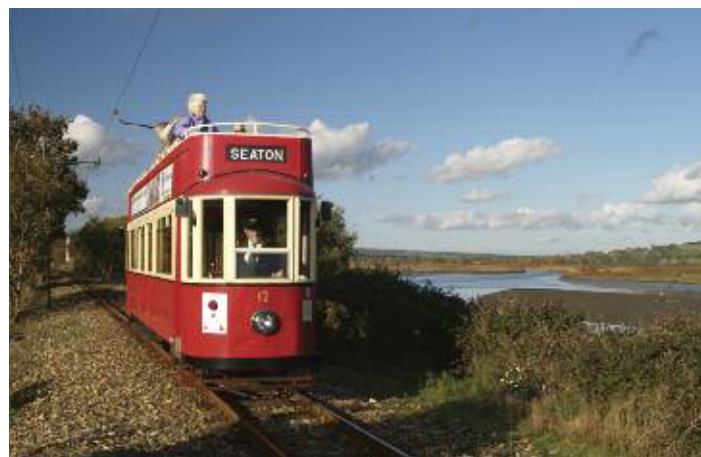
Seaton, with its stunning vistas over sea and the unique geology of the Jurassic Coast World Heritage Site, is also an ideal base for visitors to explore the beautiful surrounding area