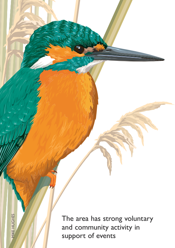
The area has strong voluntary and community activity in support of events

in medieval times, the most rebellious town in Devon! The Stop Line Way, part of the National Cycle Network, is currently being developed – the start of its route will be close to the Discovery Centre.