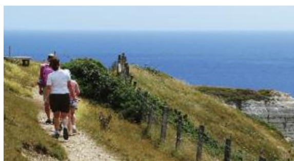
EAST DEVON AONB