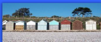
Beach huts at Budleigh