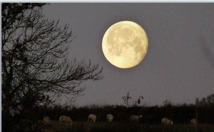
Moon on Sheep

✉ info@thelmahulbert.com ☎ 01404 45006 10am – 5pm, Tuesday – Saturday, Free Admission