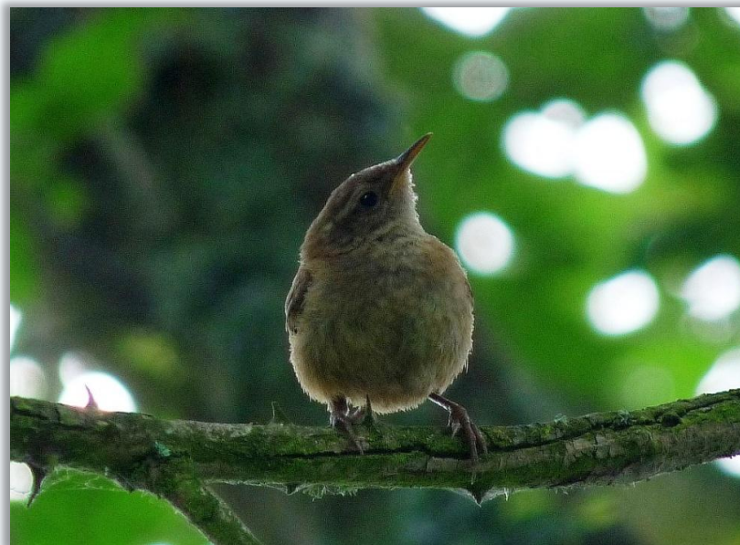
Wren

Download the May 2011 newsletter for more information on the latest projects.