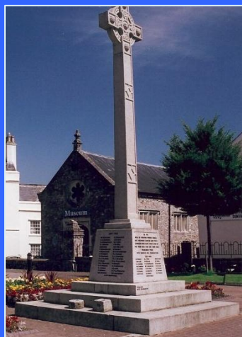
War Memorial Honiton