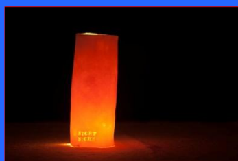
Sue Newell: delicate porcelain tea light covers in various designs