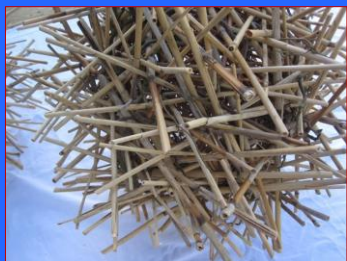
Angela Morley: decorative balls woven from a variety of natural woods