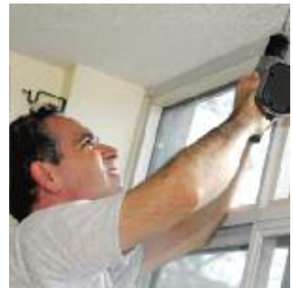
Devon Care & Repair offers a 'handyperson scheme' to assist with repairs around the home

For further details about assistance you can receive from Devon Care & Repair please call 01395 514790.