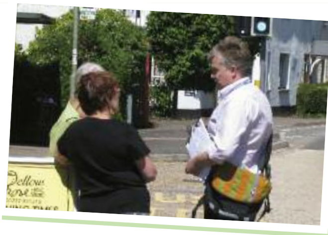
An Environmental Health Officer talks to local residents about their concerns in the area

They carried out a door-to-door survey throughout the village to enquire what concerns or comments residents had about their neighbourhood and to raise awareness about many of the services available to them.