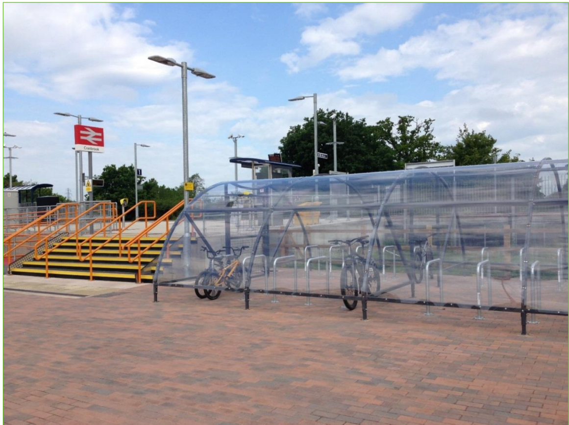
Figure 4 - Cranbrook Railway Station, located north of the western end of phase 1 of the town.