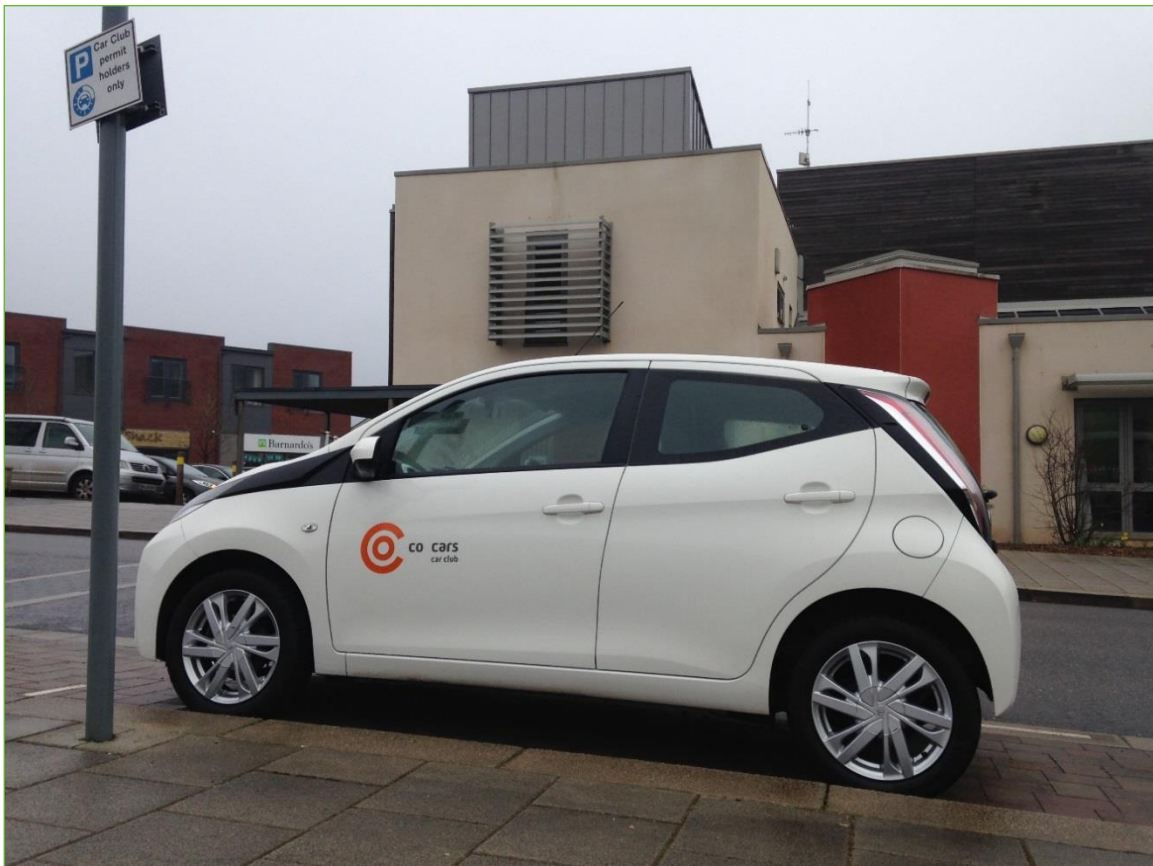
Figure 9 - Existing car club vehicle at Cranbrook. The vehicle has a dedicated parking spaces located opposite the Younghayes Centre community centre, in a central location.