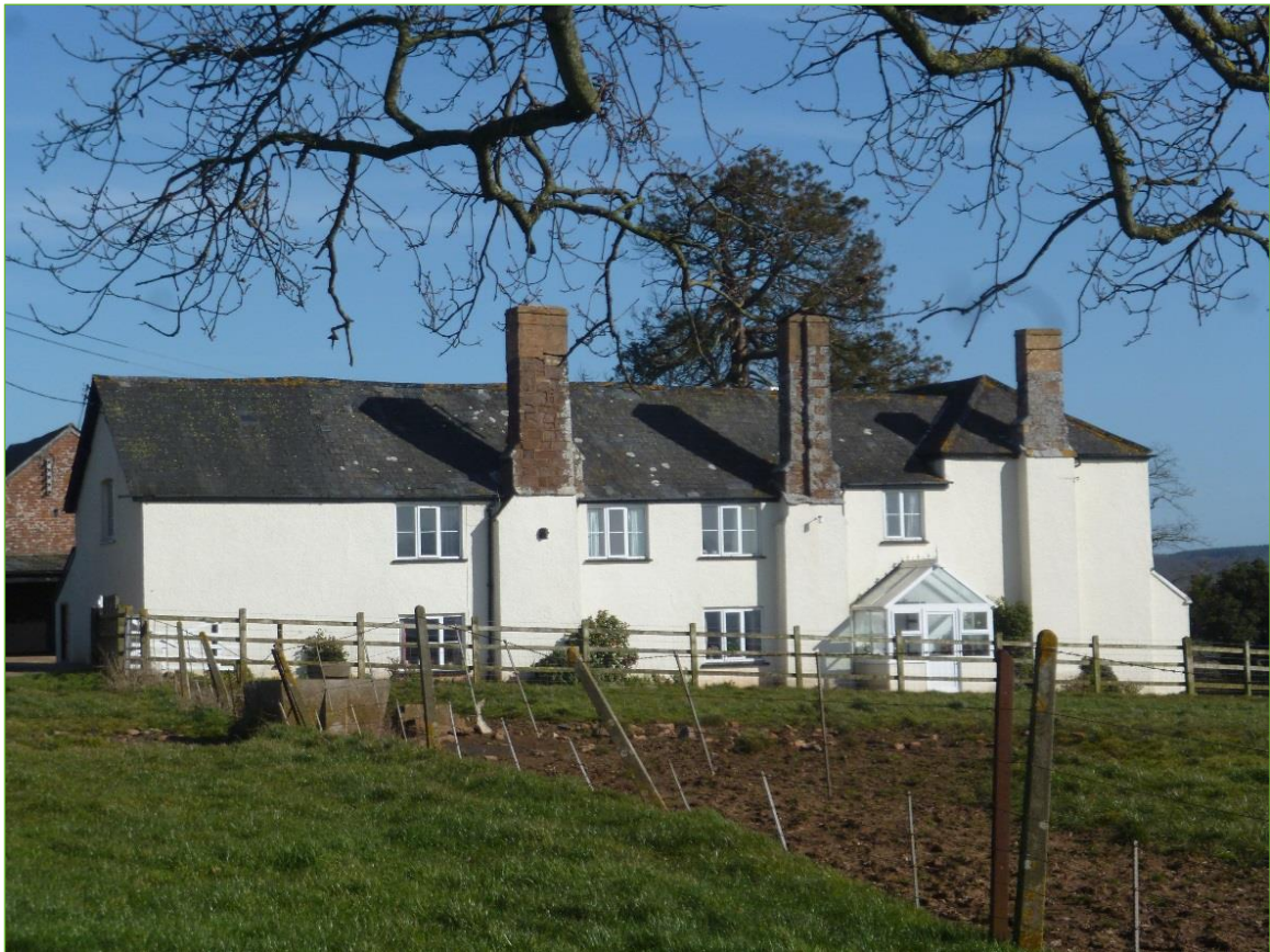
Figure 7 – Grade II listed Treasebeare Farmhouse, located to the south of Cranbrook is a key heritage asset that lies adjacent to the safeguarded land for SANGS.