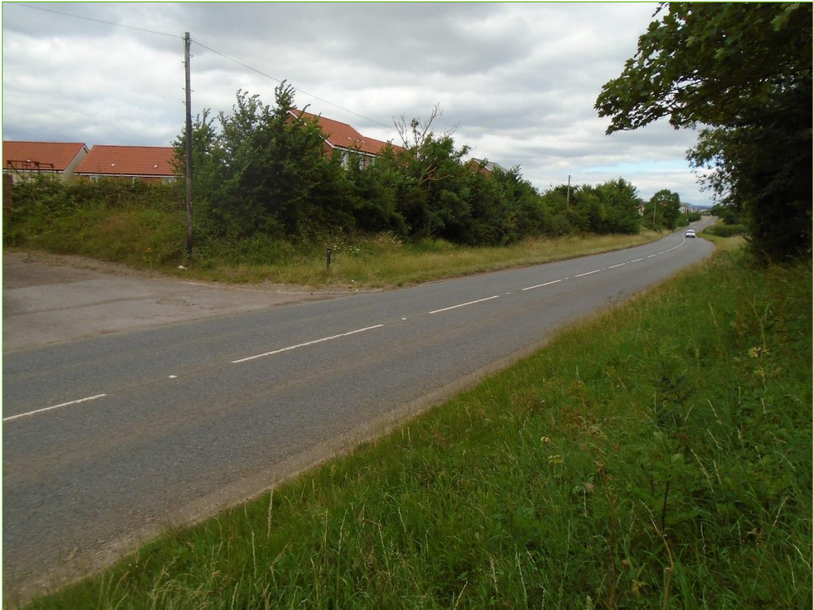
Figure 12 – London Road between Cranbrook Phase 1 and Treasbeare expansion area

London Road, its connection into the town and attractiveness of the eastern entrance into the town.