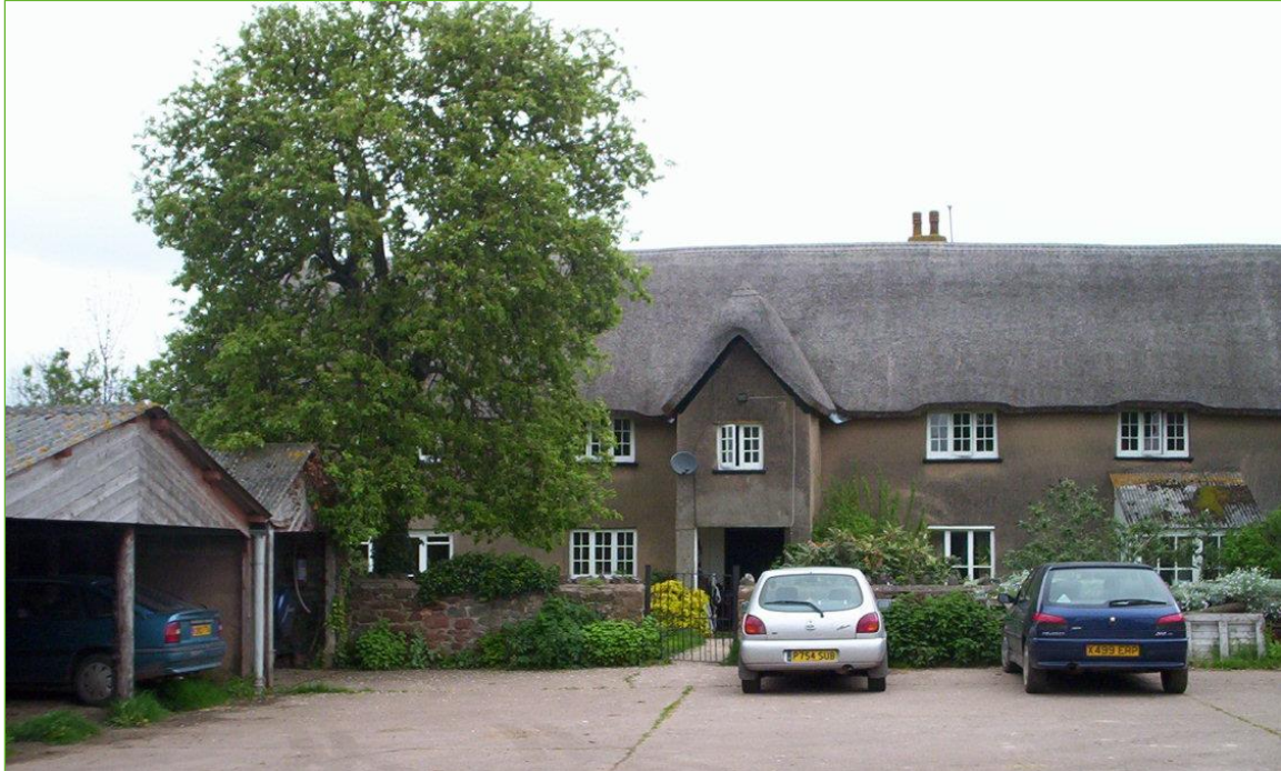
Figure 14 – Grade II listed Tillhouse Farmhouse, located in phase 2 of Cranbrook, south of the Country Park

location and therefore an alternative community or other viable use that allows the building to be restored will be supported.