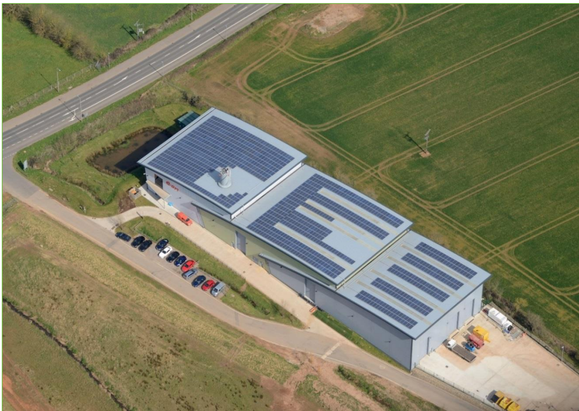
Figure 5 - Aerial photograph of the existing Energy Centre which serves Cranbrook on a district heating network. The land to the right of the energy centre is the western extent of the Treasbeare Expansion Area.