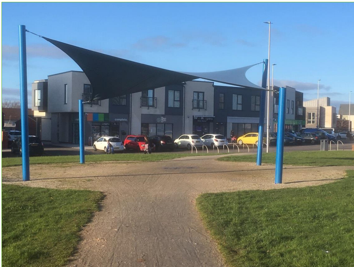
Figure11 – Neighbourhood Centre shops along Younghayes Road, Phase 1 Cranbrook