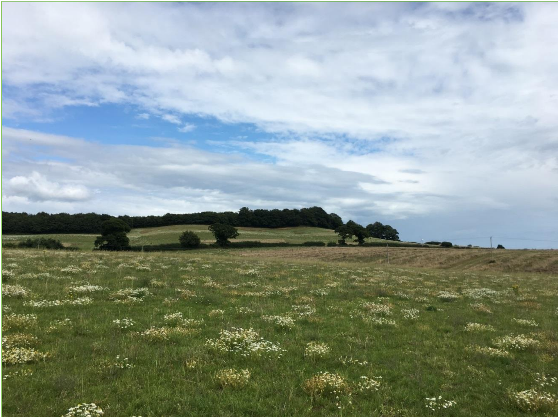
Figure 6 – Dawlish Countryside Park, which has been provided as SANGS mitigation

individual developers to ensure that they can deliver adequate mitigation, it is recognised that this can't be realistically achieved for all parcels of development. In such locations and in exceptional circumstances an off-site financial package could be considered, although the costs associated with this approach will need to accurately reflect the actual costs of acquisition, delivery/enhancement and maintenance. To assist with SANGS delivery a specific strategy has been prepared and accompanies this plan as part of the evidence base.