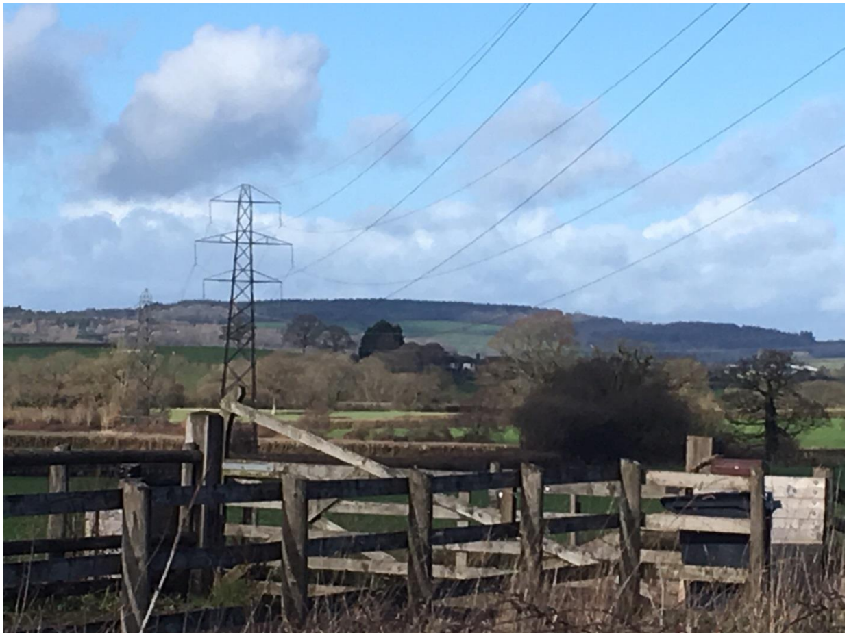
Figure 3 – pylons located within the Cobdens expansion area which will influence the phasing of delivery within this expansion area

Conservation of Habitats and Species Regulations 2017. Proper consideration must be given to this requirement in bringing forward housing development.