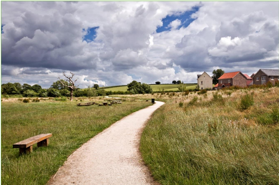
Figure 13 - Cranbrook Country Park, which links phases 1 and 2 of the original outline planning permission site and incorporates a range of habitats and opportunities for recreation.