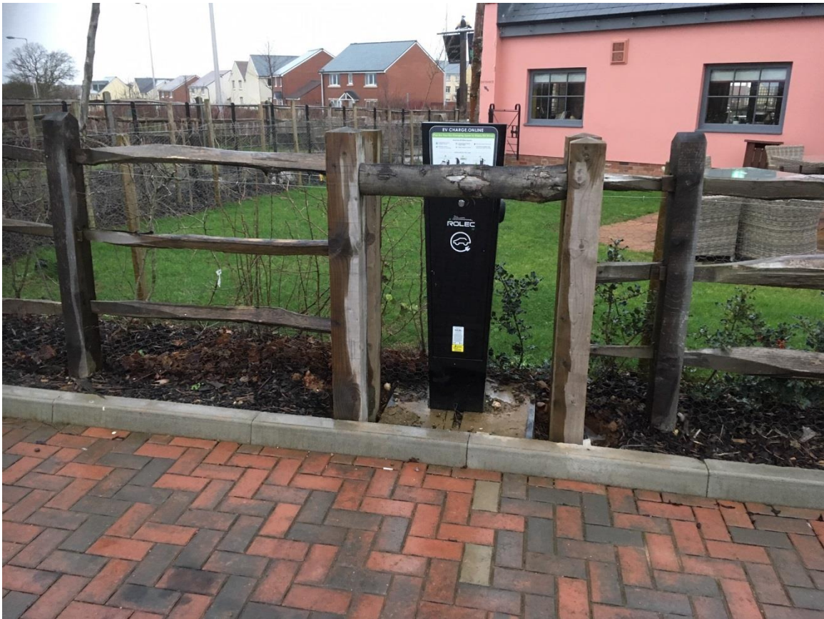
Figure 10 – existing EV charging at Cranberry Farm, Cranbrook