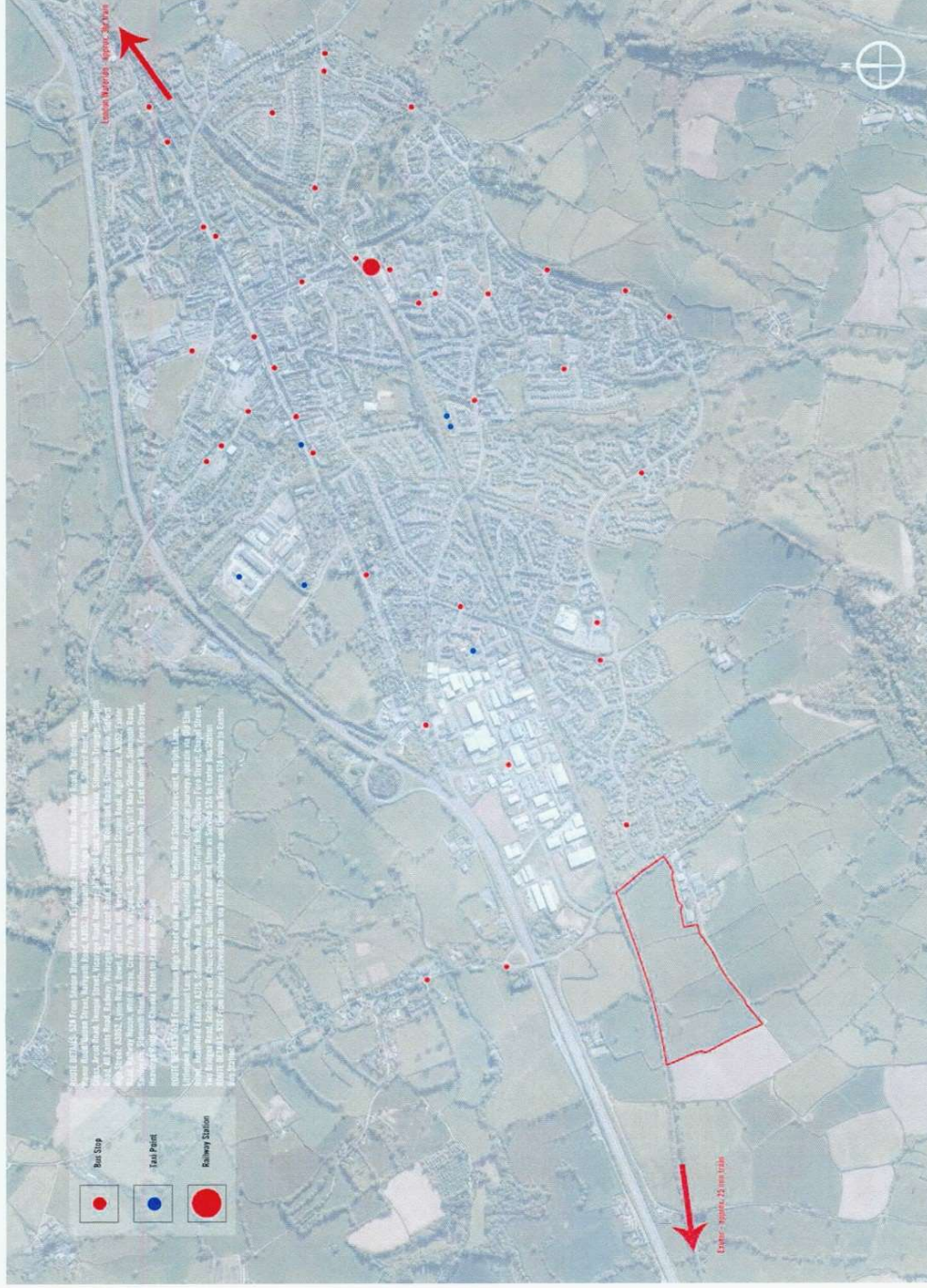
Public Transport within Honiton

Honiton Railway Station opened in 1860 and is currently operated by South West Trains, providing services on the London Waterloo to Exeter route. A popular route is the train from Honiton to Exeter for many high order services Exeter has to offer, taking approximately 25 minutes. The station is situated off of Church Hill, a short walk from the central high street, highlighted on the plan.