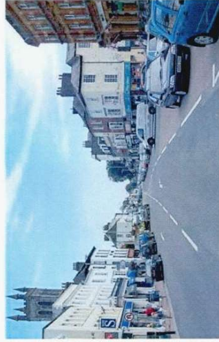
High Street, Honiton

In exploring the vernacular around the central high street it became apparent that the use of render appears frequently. Whilst a degree of tonal variance is apparent, the theme is very much of light, pastel shades, included whites, creams, to soft blues and yellows. This use of render transcends through to the residential development in Honiton, including the site-adjacent Old Elm Road housing. Again soft render is found in plentiful supplies, however the residential brings forth brickwork also, and in many occasions a combination of brickwork and render as a facade choice. Amongst the abundance of brick and render, there are also rarer moments of timber cladding used in sections to emphasise specific areas of interest, feature windows and such.